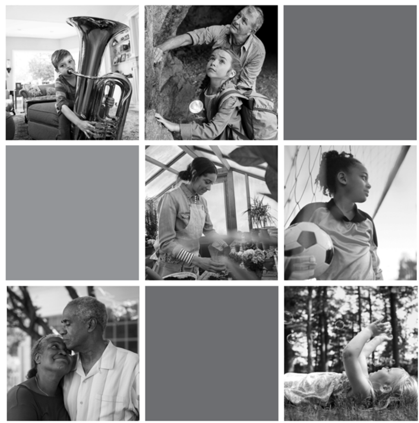
Your Health Care Benefits Program