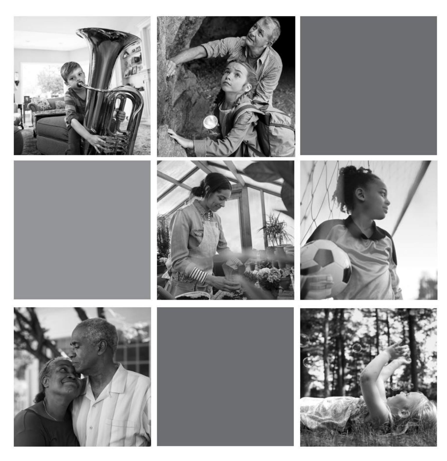
Your Health Care Benefits Program Managed Health Care Pharmacy Benefits

Blue Cross and Blue Shield of Texas, a Division of Health Care Service Corporation, a Mutual Legal Reserve Company, an Independent Licensee of the Blue Cross and Blue Shield Association