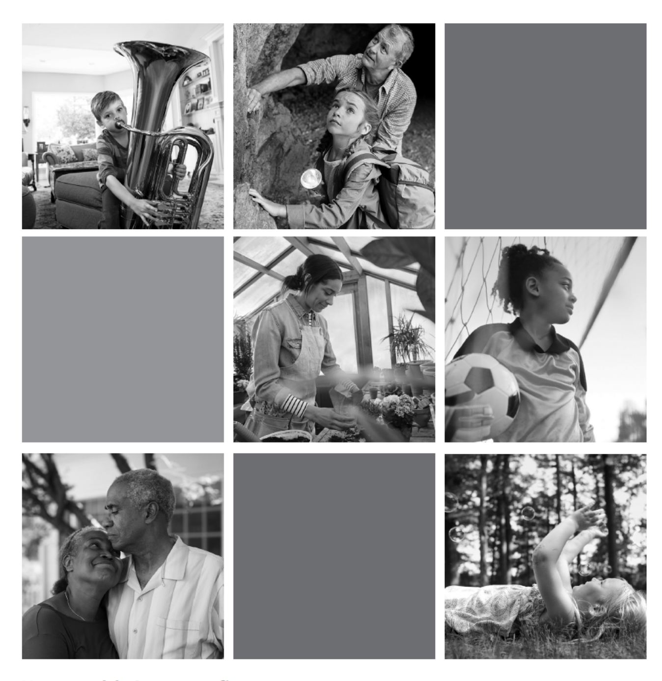
Your Health Care Benefits Program Managed Health Care Pharmacy Benefits